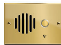
DSF3 Flush-Mount Door Station