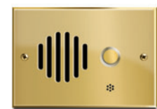
DSS3 Surface-Mount Door Station