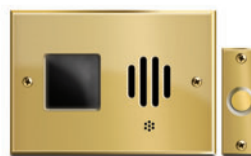
DSC3 Flush-Mount Door Station with Hi-Res Color Camera